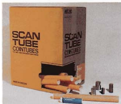
Convenient storage and dispensing of ScanTubes.

Extra visibility markings for value and quantity.