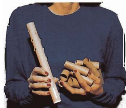
ScanTube's taper means easier handling and up to 80% less storage space.

Add up the engineered features that make ScanTube the most convenient coin package in the industry and you'll want to order yours today!